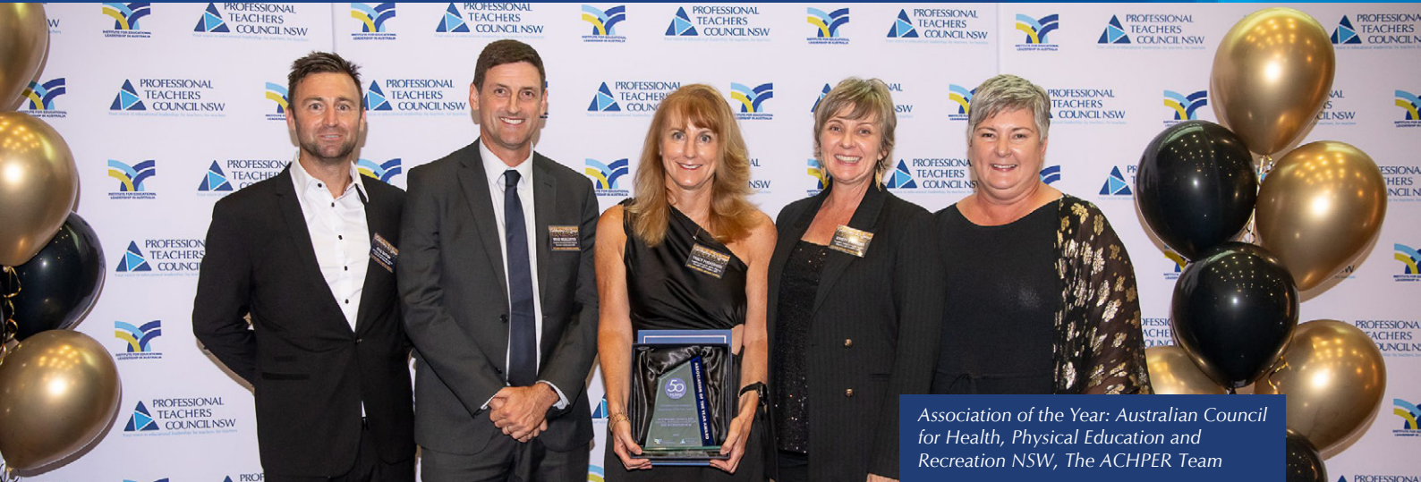
Association of the Year: Australian Council for Health, Physical Education and Recreation NSW, The ACHPER Team