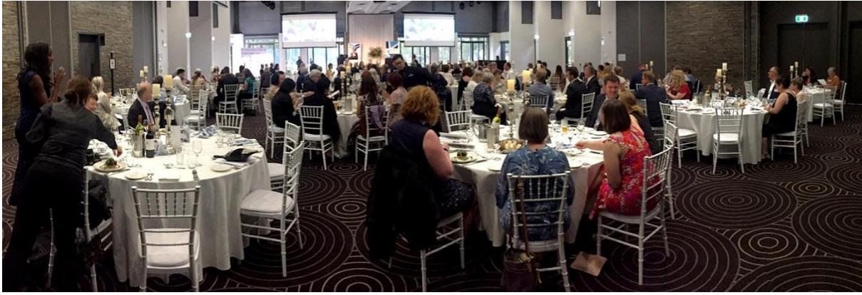
Wednesday 17 February - Waterview, Sydney Olympic Park venue for the 2020 IELA Awards

Our awards acknowledge all classroom teachers in NSW, but in particular through the medium of PTC NSW and IELA, we are recognising and awarding those volunteers who through the not-for-profit Teacher Professional Associations provide vital support and professional learning for their colleagues across all jurisdictions in NSW.