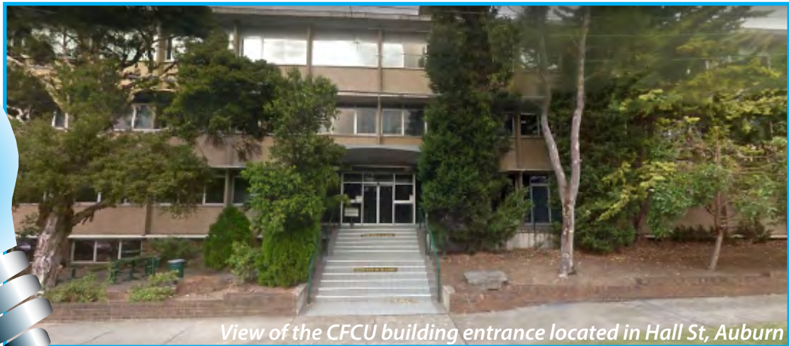
View of the CFCU building entrance located in Hall St, Auburn